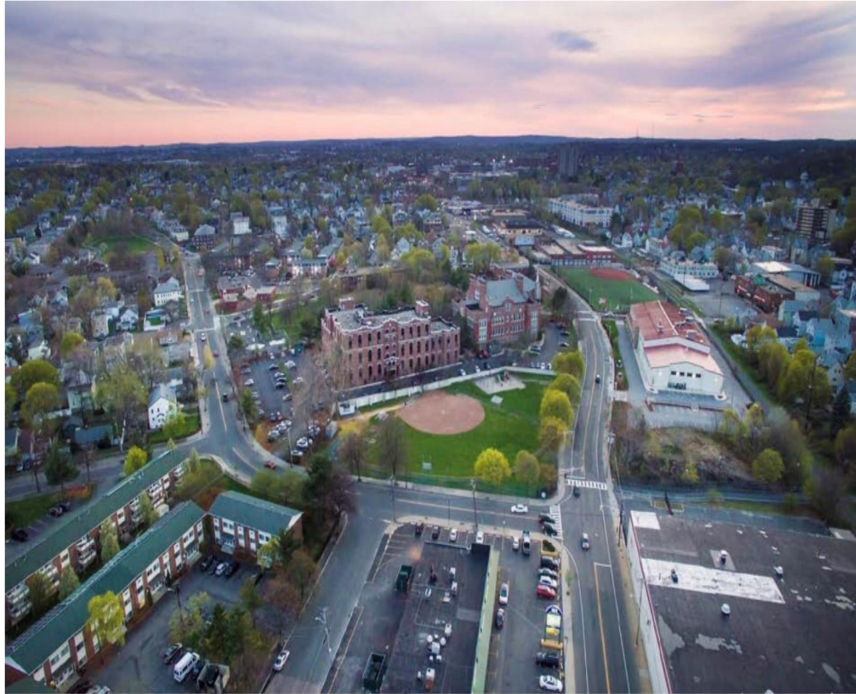
t: City of Malden